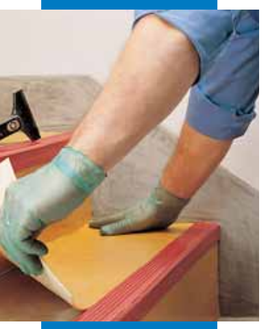
Spreading Adesilex VZ of the backing of a PVC covering