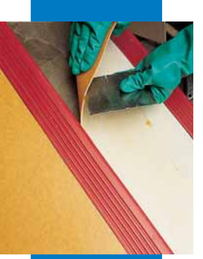
PVC installation on a step