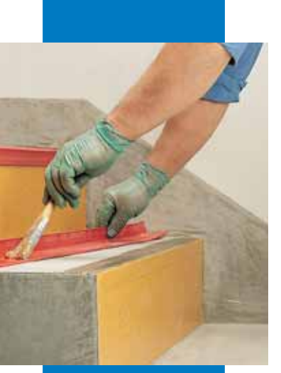
Spreading Adesilex VZ on the backing of a PVC step nosing

dust and loose particles, varnish, wax, oil, rust, traces of gypsum and products that may prevent bonding.